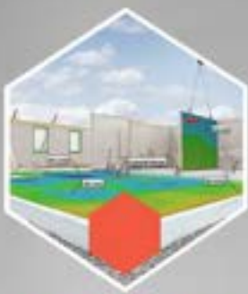
Flatness and Level Checking

Seamless capture and monitoring of construction progress for legal and technical documentation;