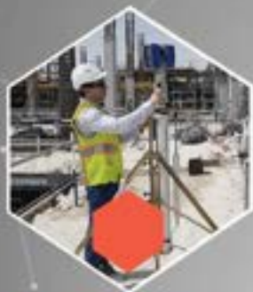
Construction Process Monitoring

Precise laser scanning survey ensures that the final as-built condition fit design intent and minimizes the chance of potential problems;