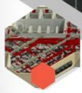
MEP Survey Services

MEP documentation, as-built survey and 3D modeling;