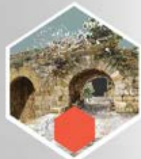
Heritage Scanning and Preservation

3D Models high-end renderings using specialized software