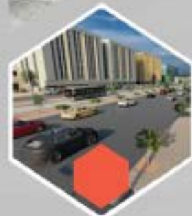
3D Models High-End Renderings

3D Models high-end renderings using specialized software